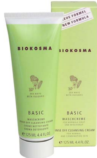
RINSE OFF CLEANSING CREAM