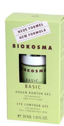
EYE CONTOUR GEL