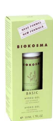
HYDRO - GEL