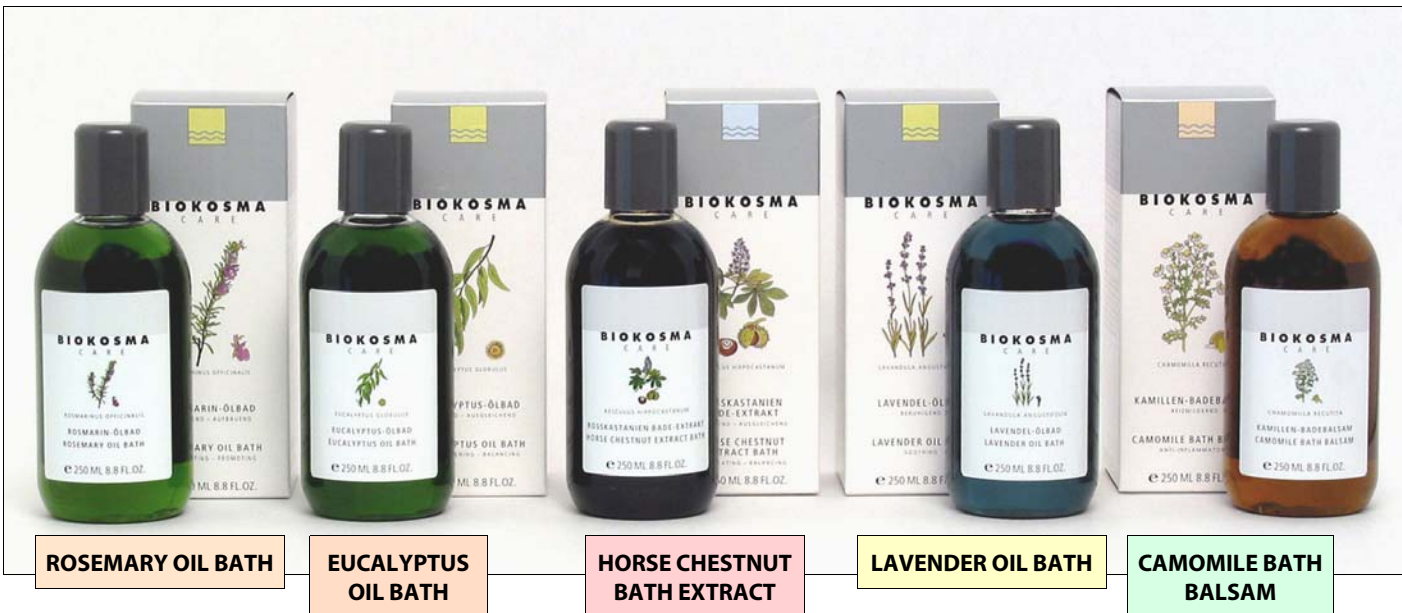
ROSEMARY OIL BATH