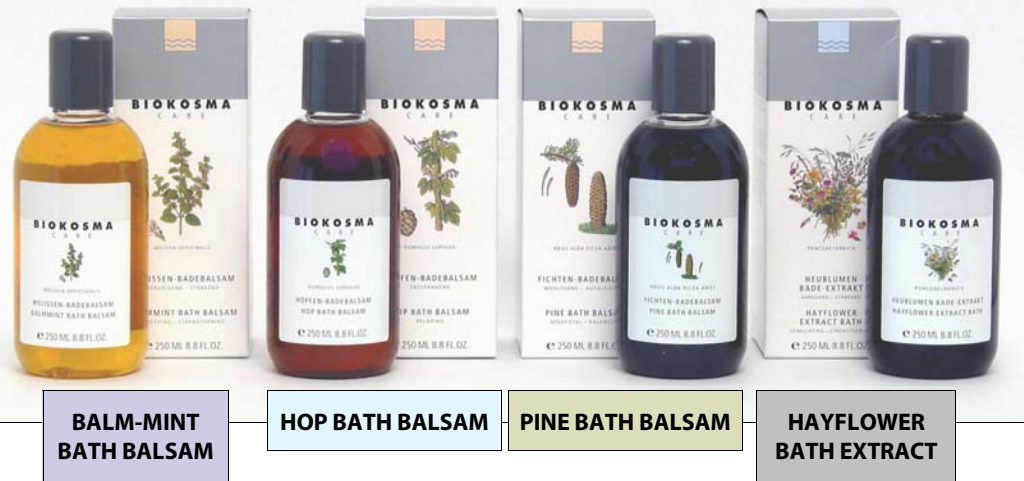
BALM-MINT BATH BALSAM