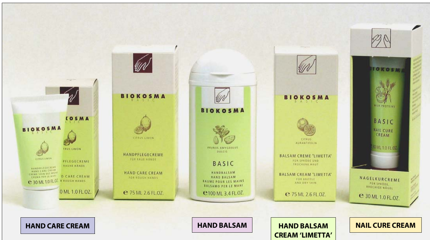
HAND CARE CREAM