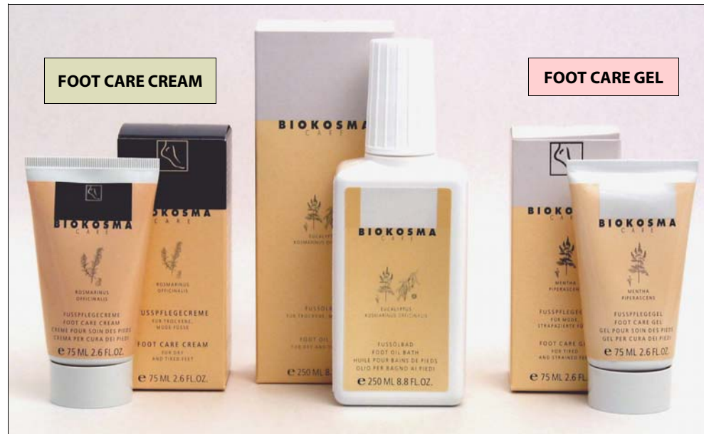
FOOT CARE CREAM