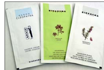
Sample sachets available for most products